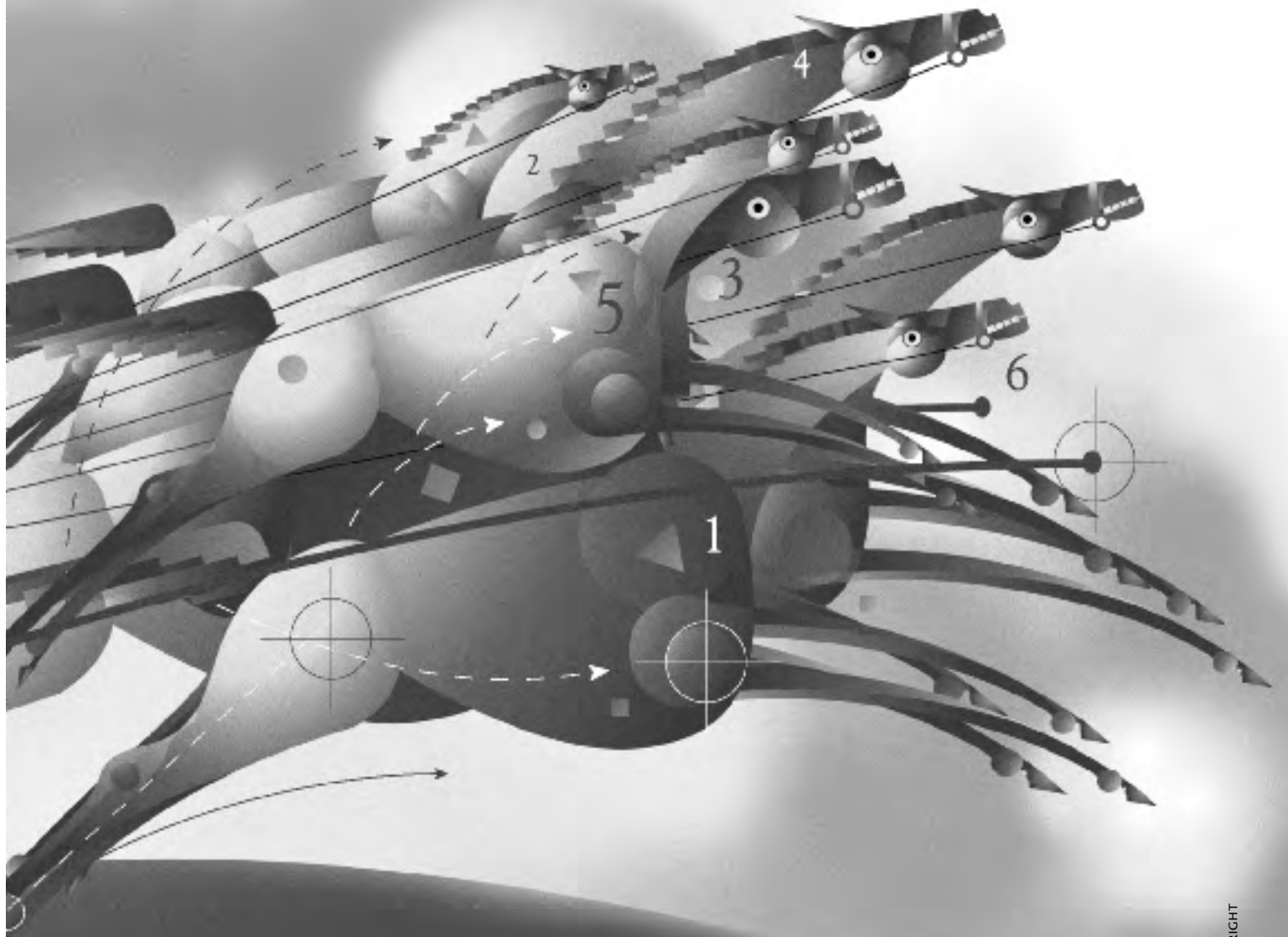
ILLUSTRATION: SCOTT WRIGHT

No leader can succeed without mastering the art of persuasion. But there's hard science in that skill, too, and a large body of psychological research suggests there are six basic laws of winning friends and influencing people.